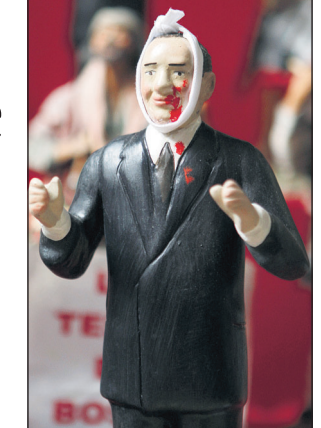
A figurine of Italian premeir Silvio Berlusconi is displayed in a nativity scene in Naples on