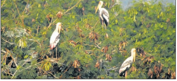
White storks in Bengaluru.

"The spotting of many rare birds is surely a sign of watchers spotting change in migration pat-Amur falcons and white terns. If the recent rains and hit by climate change. How- migration path and spotting