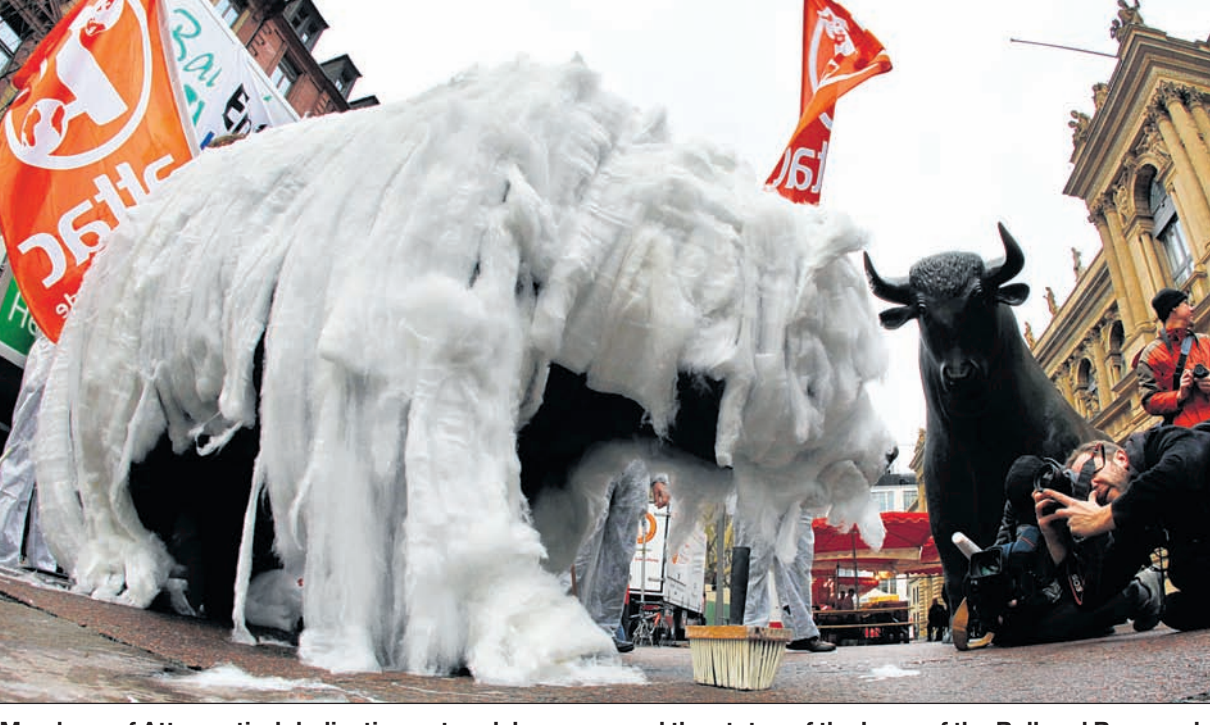
Members of Attac anti-globalisation network have covered the statue of the bear, of the Bull and Bear sculpture, with cottonwool in front of the stock market in Frankfurt, Germany, on Friday demanding fair climate negotiations in Copenhagen.

The immediate reaction of delegates, including those from the Indian government, was that the drafts left far too many things unsaid — such as the extent to which rich countries will cut emissions of greenhouse