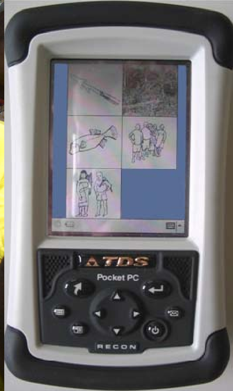
GPS handheld computer specially made for non-literate people and for forest use