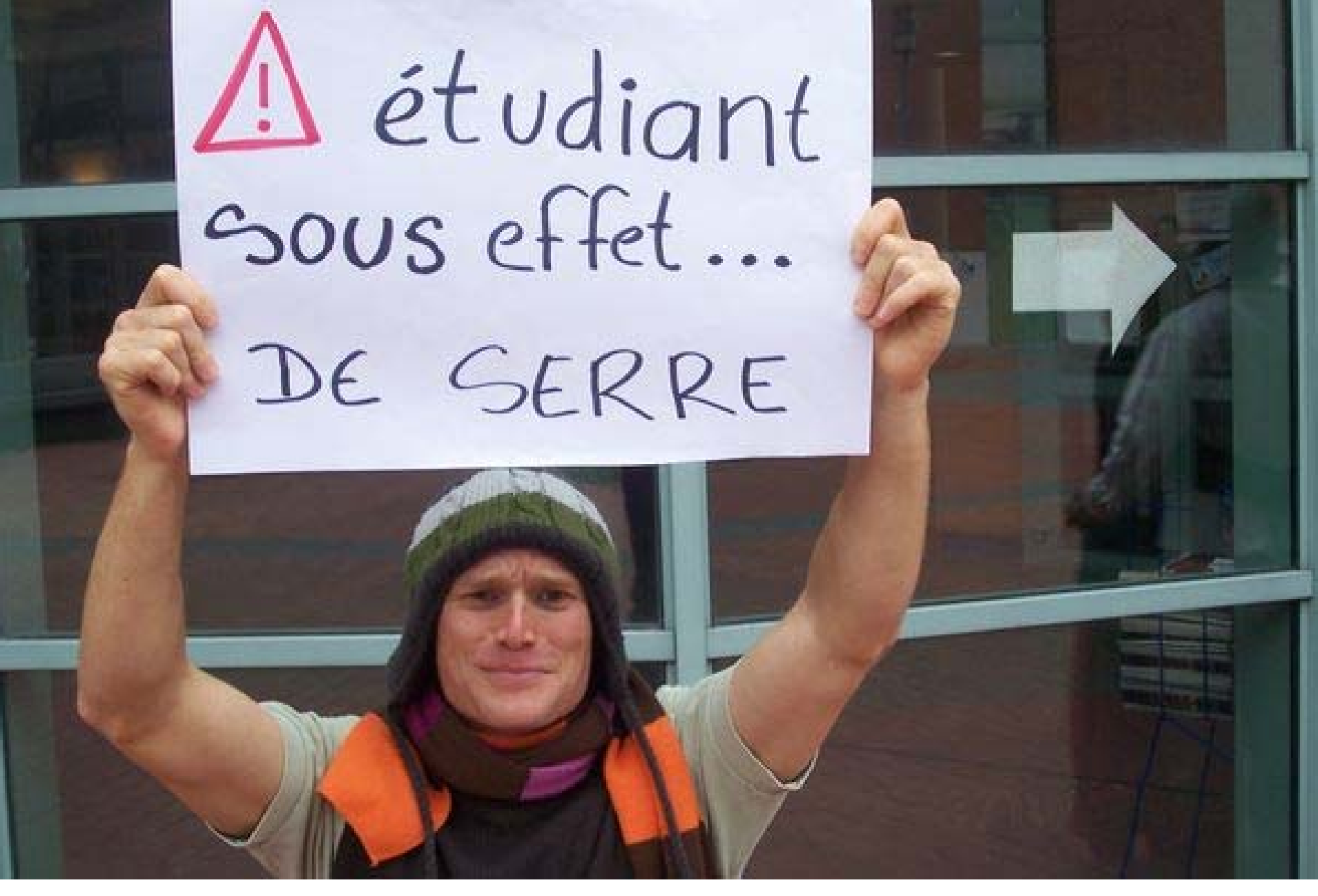
Student under... Greenhouse effect!