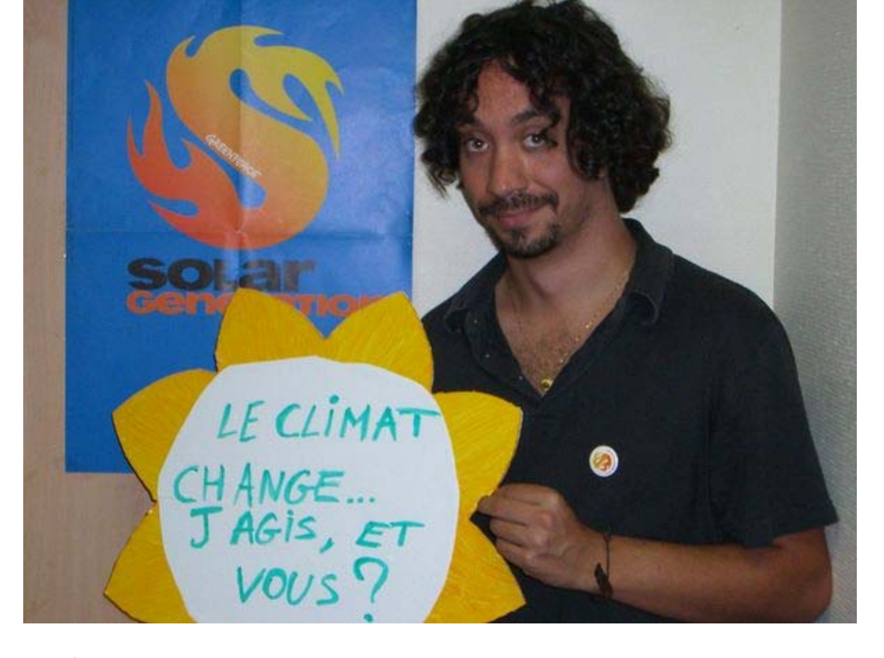
Climate is changing... I'm taking action, and you?