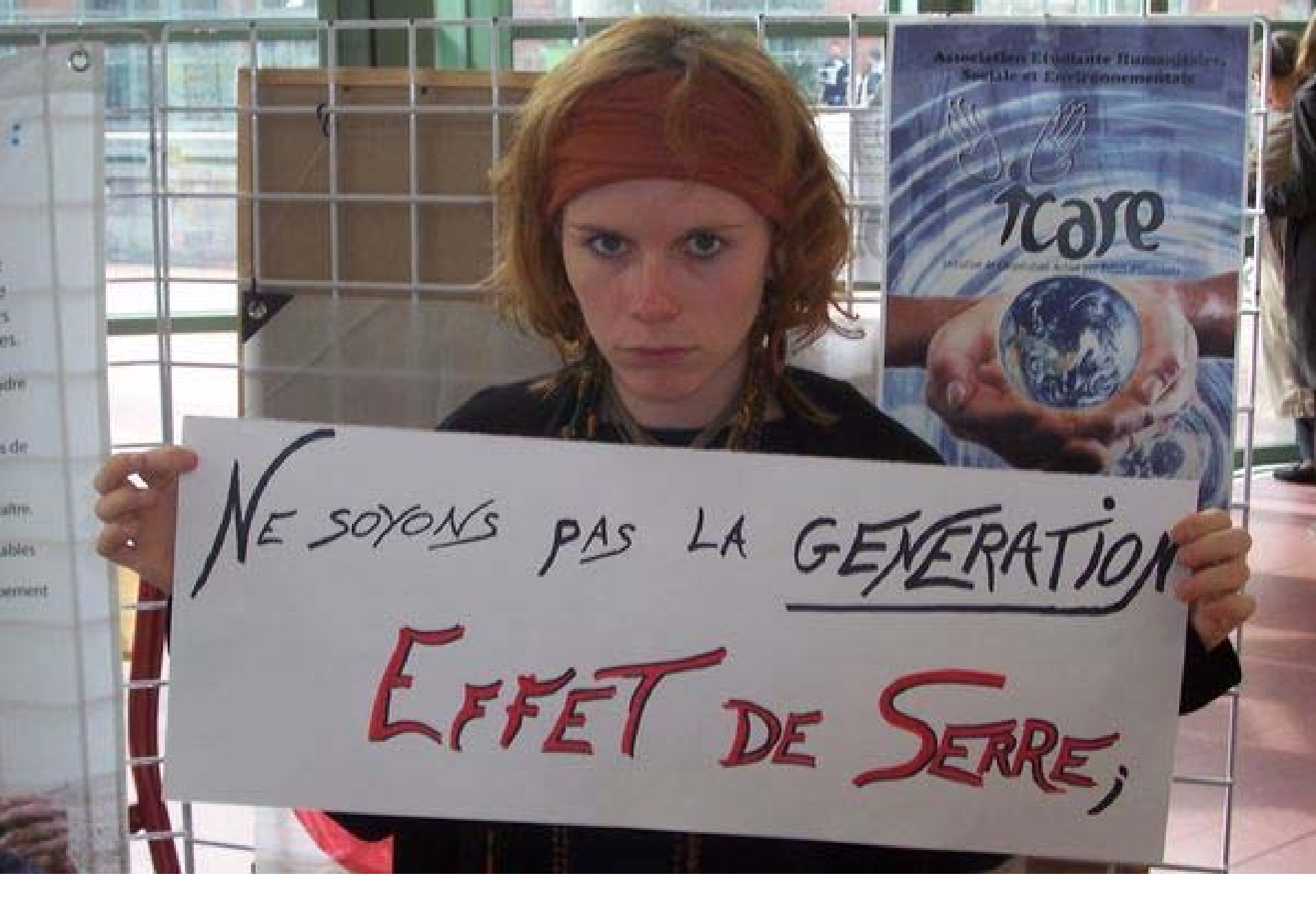
We don't want to be the « fossil generation »