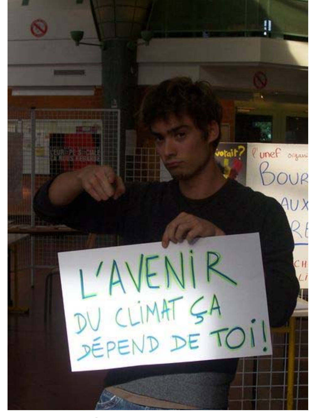
Future of Climate depends on you!