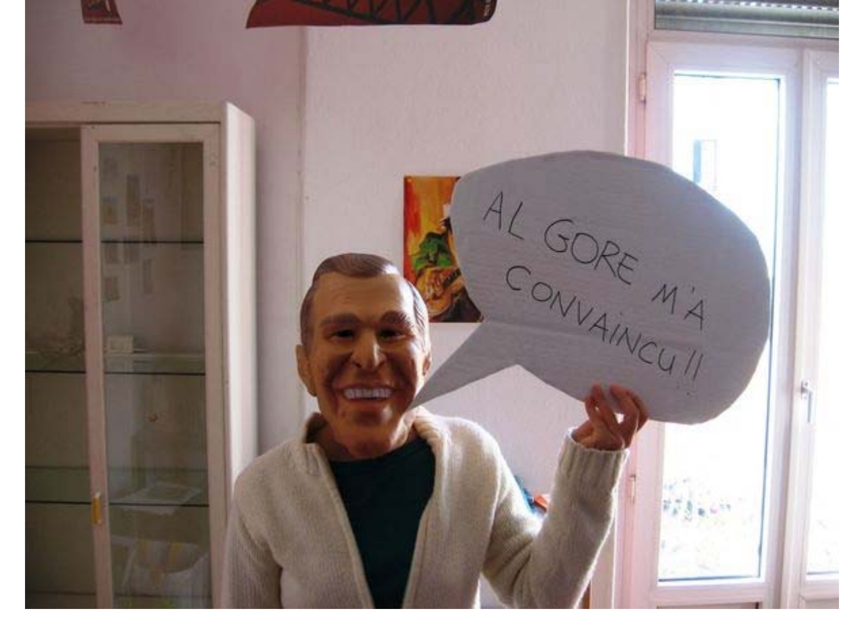
Al Gore convinced me!!