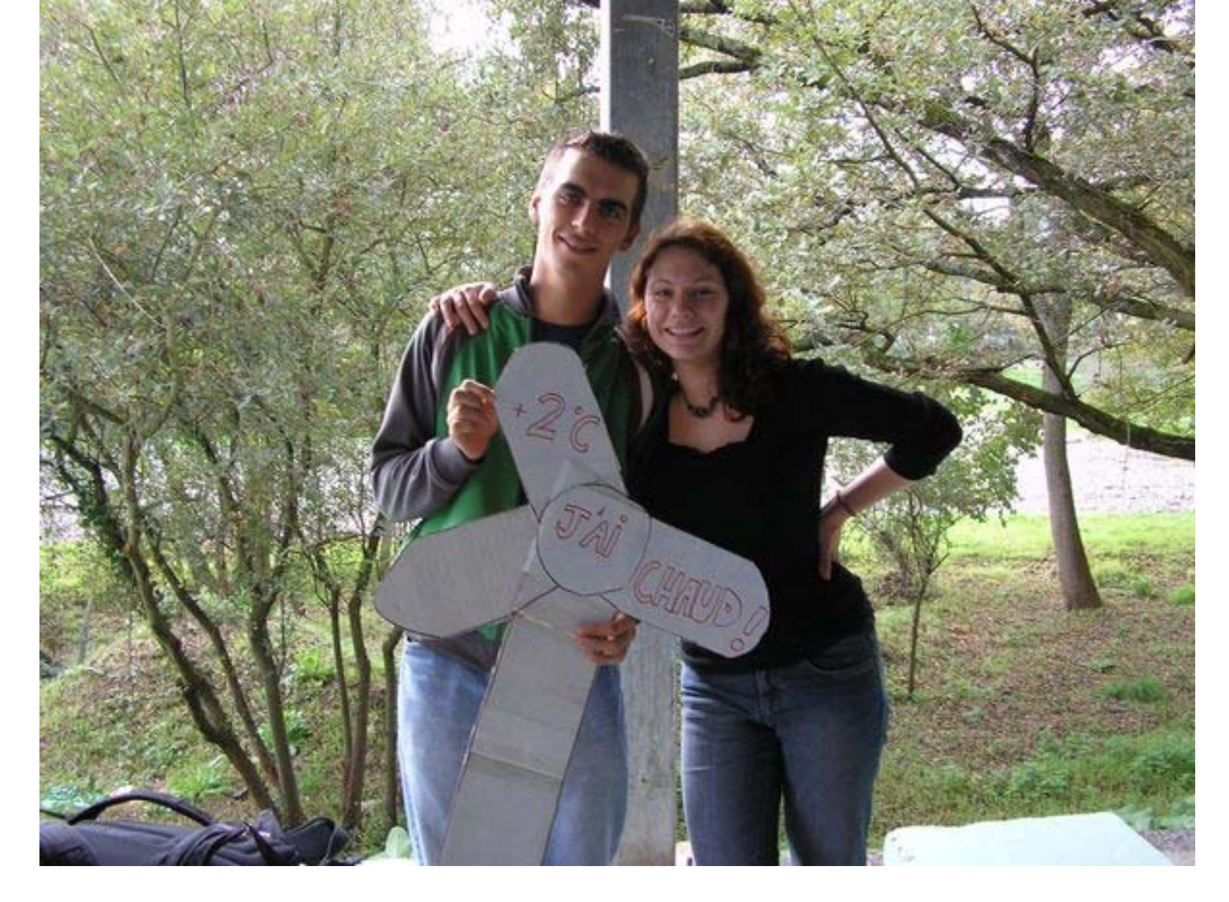
+2°C I'M SO HOT!