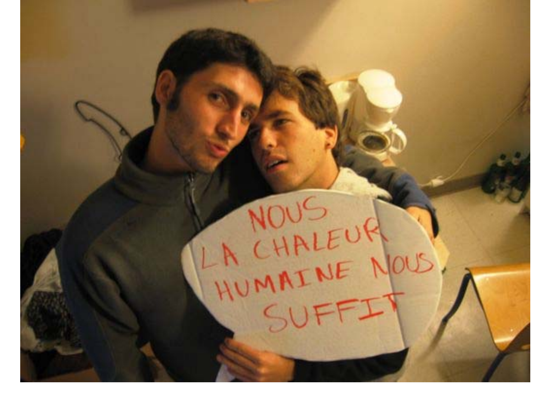
We just need human heat