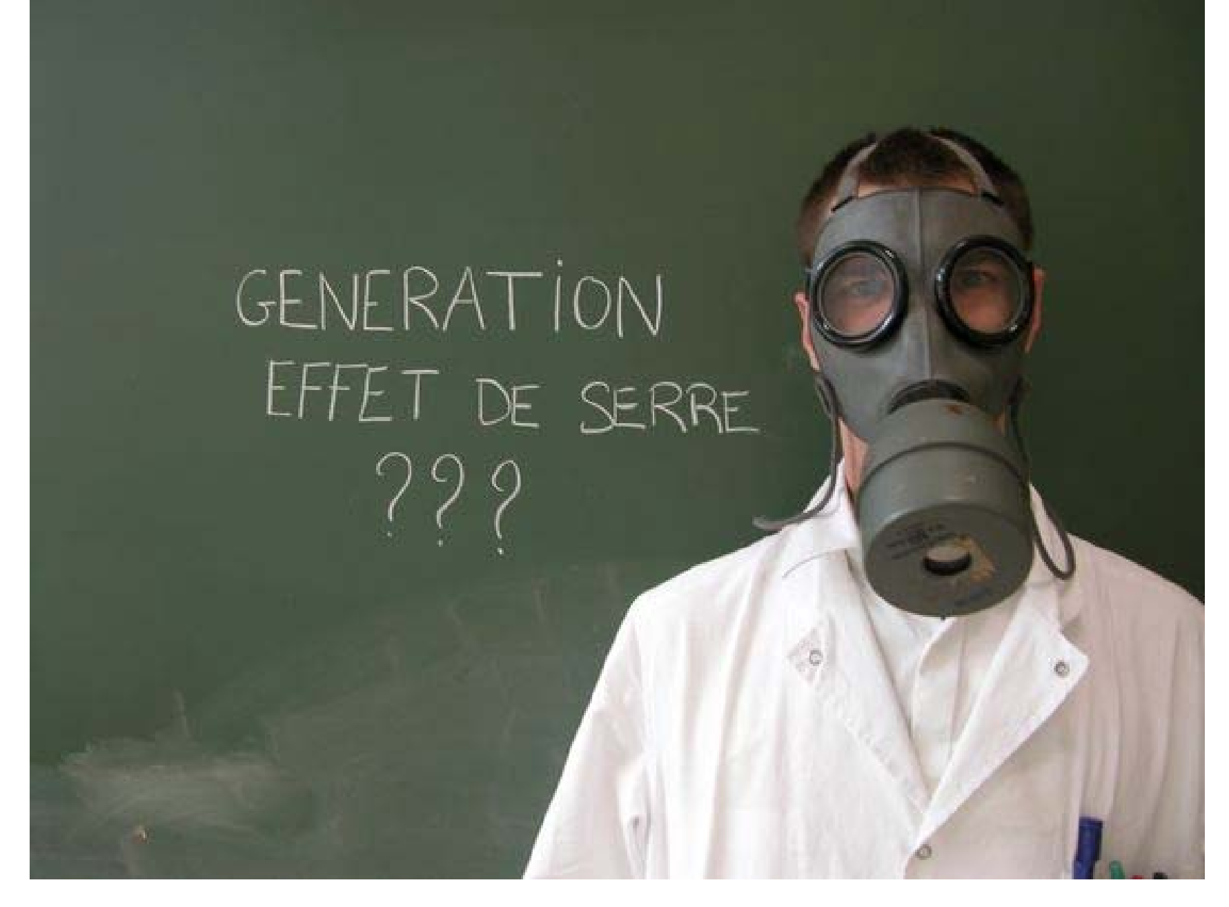
Greenhouse gas generation ???