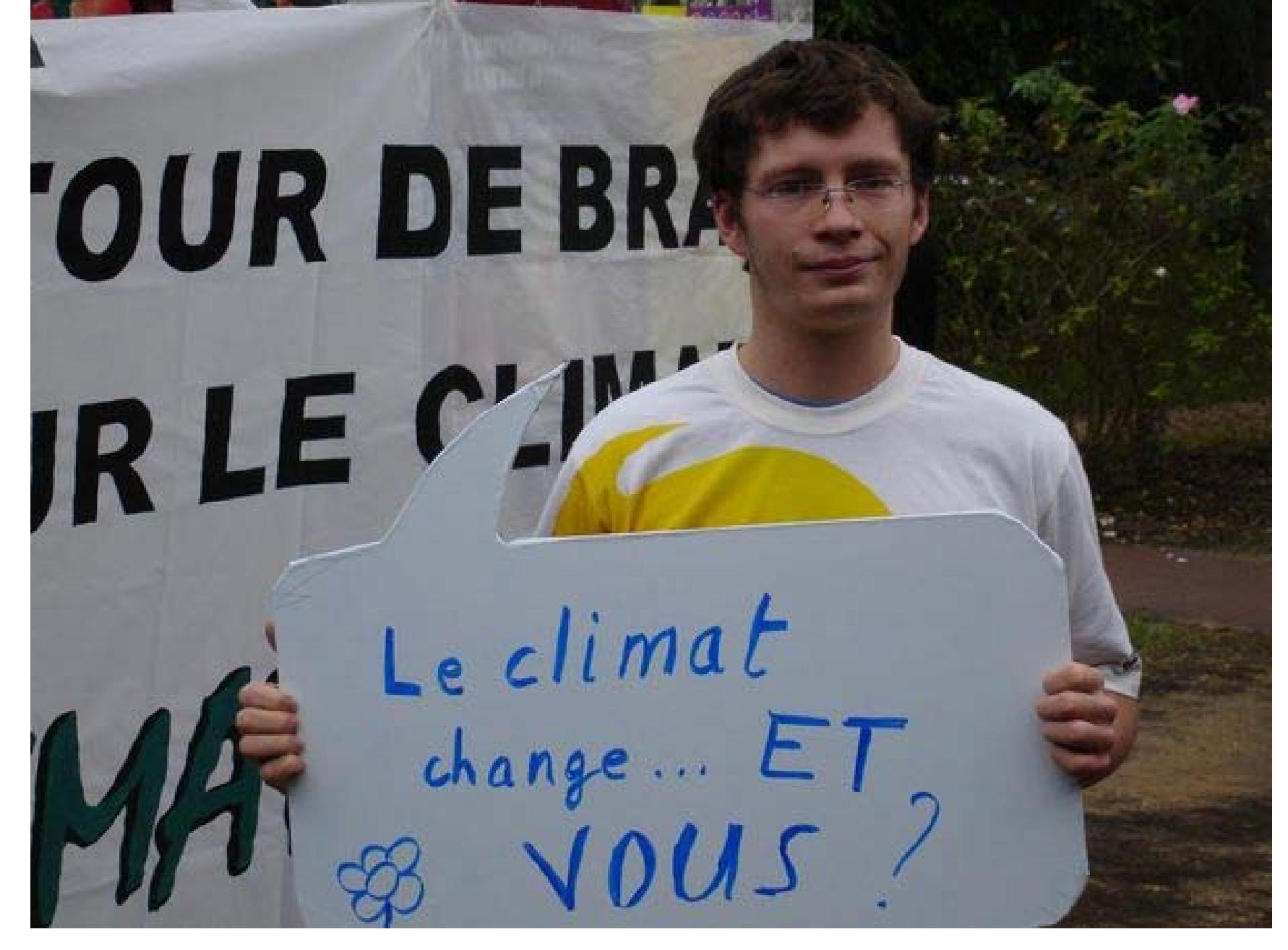
Climate is changing... AND YOU?