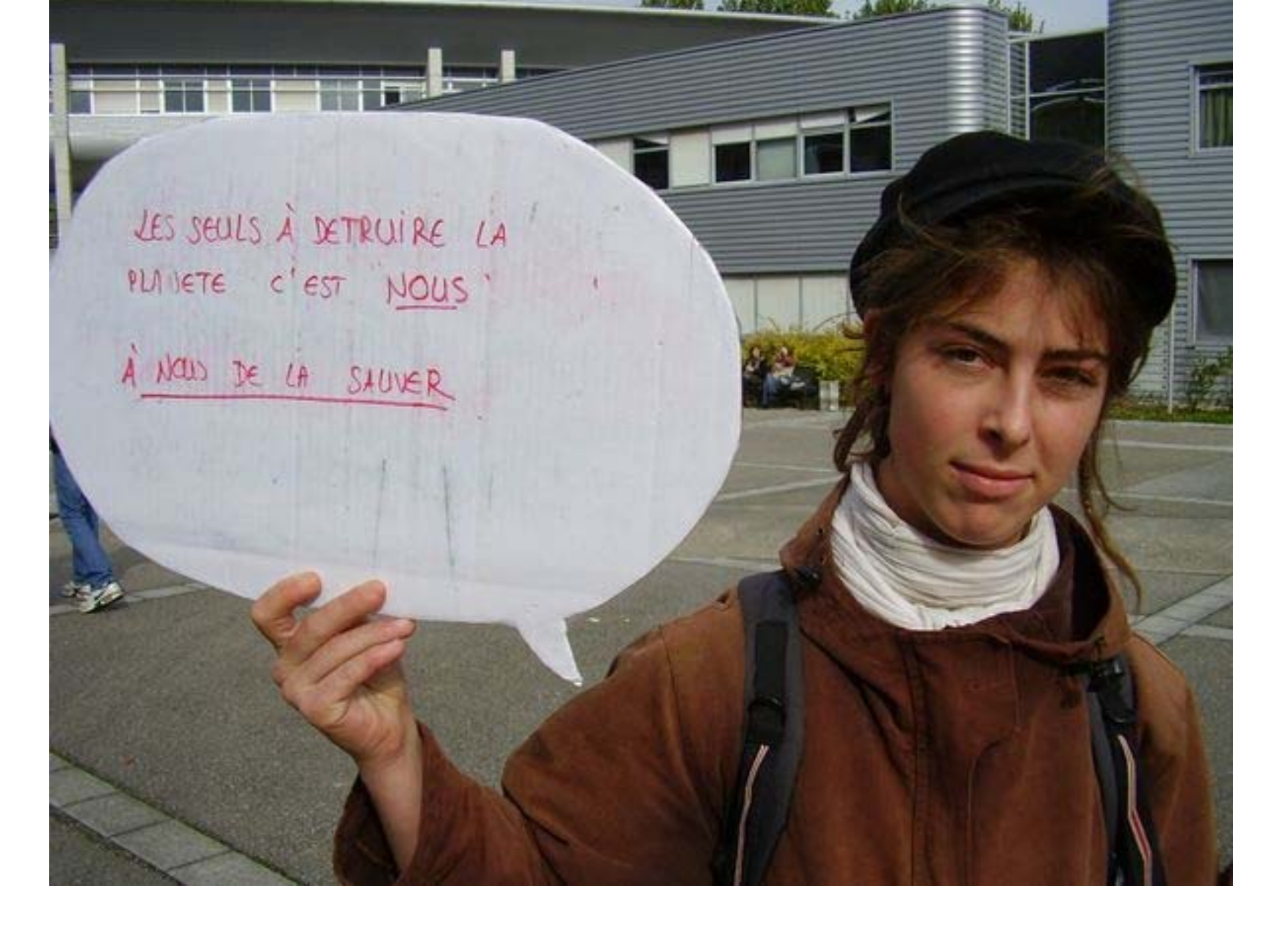
WE destroy the planet, WE need to save it