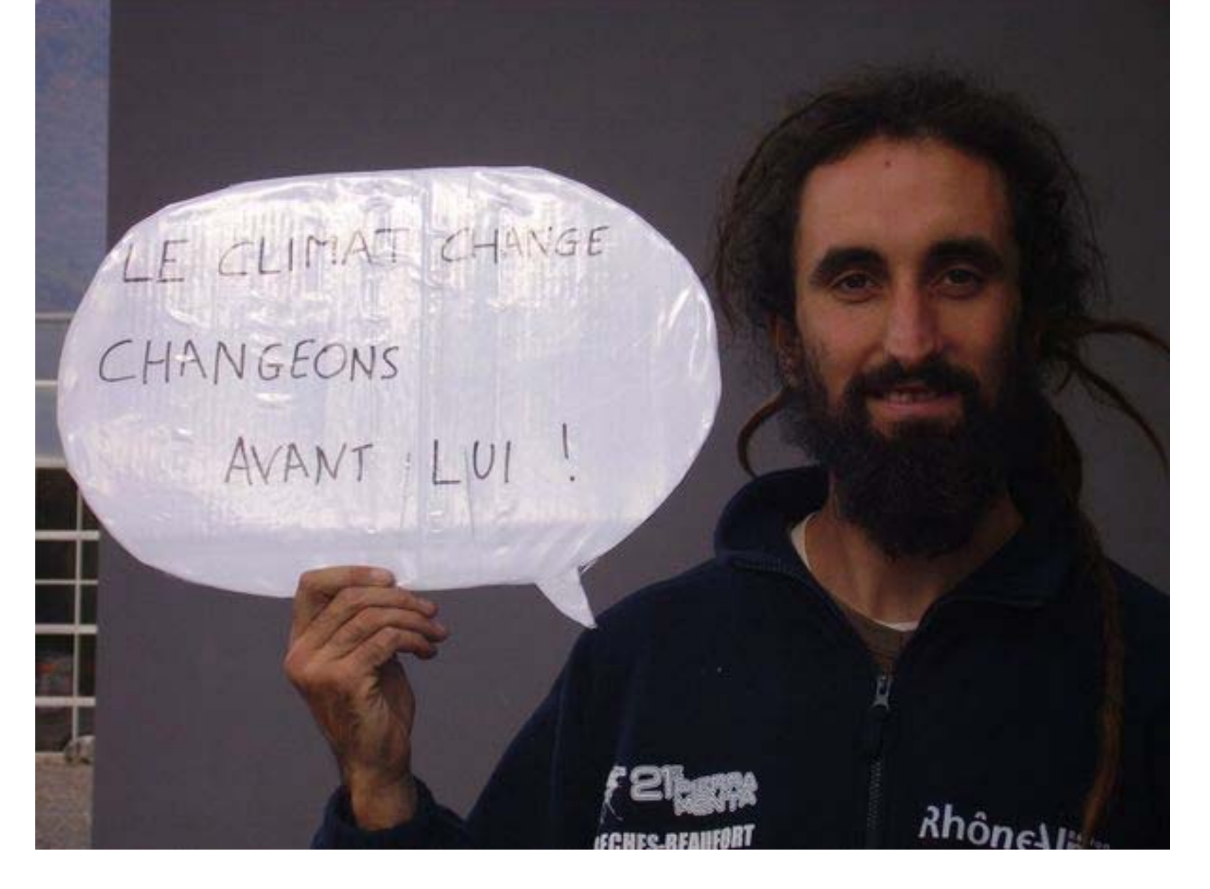
Climate is changing, we must change before!