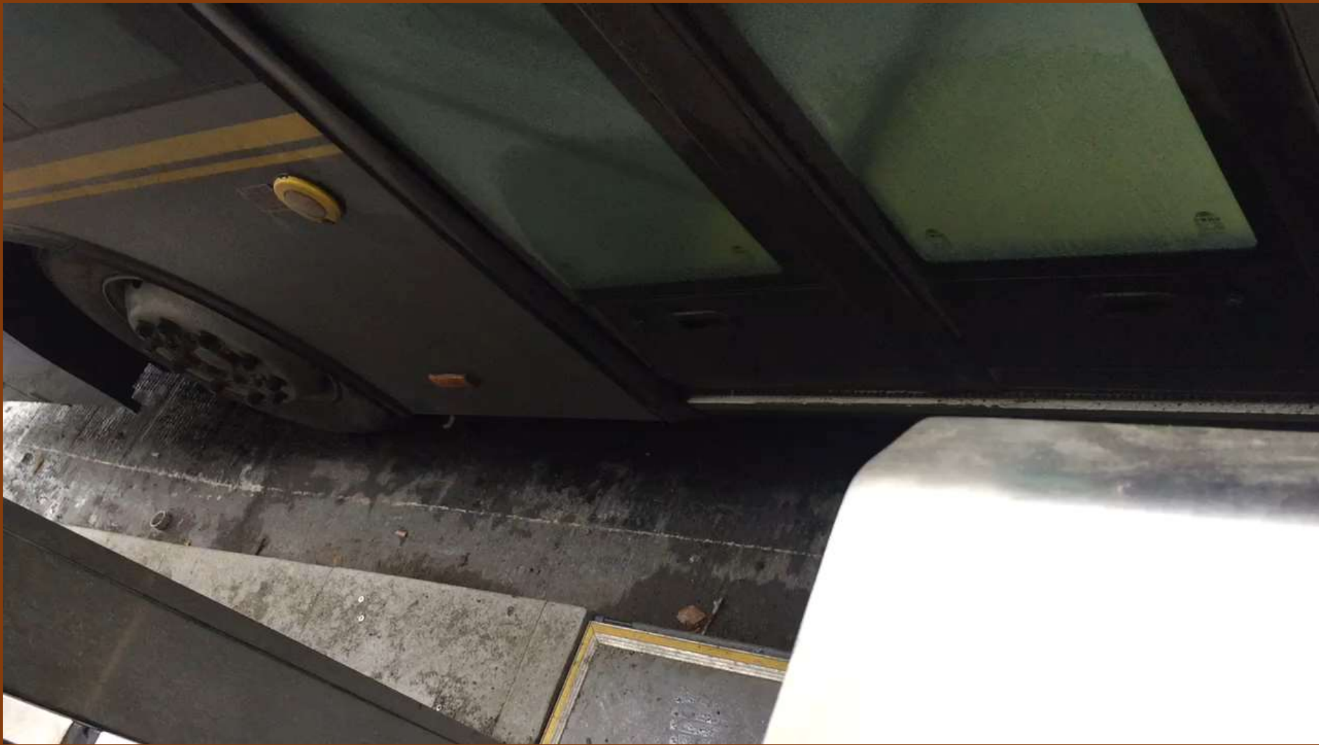
Video 1 – platform extension