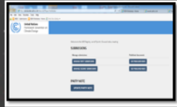
Country page allows Party to upload, submit and manage documents comprising individual NDCs

Launched May 2016 - revised Oct 2016 http://www4.unfccc.int/ndcregistry/Pages/Home.aspx