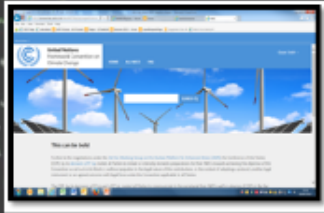
Public landing page and country page allow users to browse and search information

enables Parties to communicate and record their first NDCs