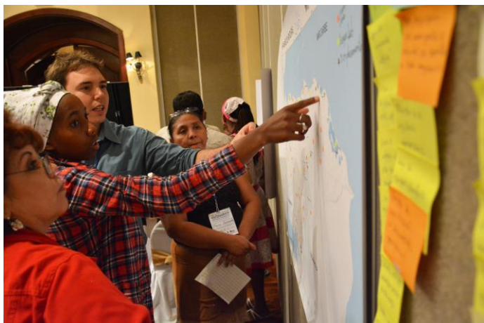
Participatory scenario building helps countries set climate change action priorities.

When the future is uncertain – in economic and social terms, not just climatic – shared models of how the future might plausibly turn out provide a critical tool for public sector policies and private sector strategies. In Cambodia, the Ministry of Agriculture, Forestry and Fisheries used participatory future scenarios for priority setting to develop its 2014-2018 Climate Change Priorities Action Plan. Similar approaches have been used widely around the world, including in Kenya and Honduras. Participatory scenarios can be complemented with quantitative models to assess the potential performance of different adaptation measures under a variety of possible futures.