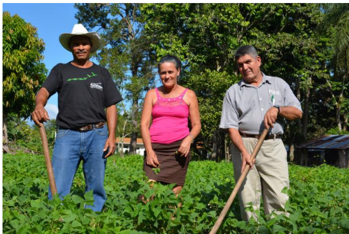
Including both men and women in developing adaptation measures can help close the gender gap.

Rural women play an increasing role in smallholder agriculture as a result of out-migration of men. In least developed countries, 79% of economically active women report agriculture as their primary economic activity. Women and men farmers have different vulnerabilities and capacities to adapt to climate change. Women face lower access to resources, finance, information and extension services. Adaptation measures can provide co-benefits to gender equality and social inclusion. Greater engagement with women in technology design and management decisions can help maximise women's potential as agents of change. For example, in western Kenya, training and agro-advisory services directed at women have helped reduce by 60 percentage points the number of households that experience at least two months per year with one or no meals per day.