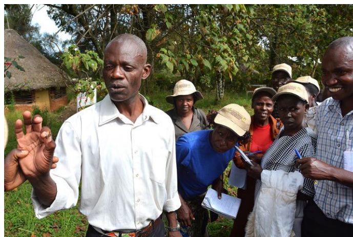
Indigenous knowledge can strengthen development of adaptation measures, and contribute to successful implementation.

Indigenous knowledge strengthens adaptation measures in multiple ways: by providing a wealth of observations and insights beyond the power of external experts, embedding solutions in local cultures, and by broadening the values and viewpoints at stake. Stakeholder engagement taps into indigenous knowledge when designing and implementing adaptation measures. For example, in Tanzania, participatory planning has provided a platform to integrate indigenous and scientific climate knowledge to support smallholders' decision-making and planning, while in Senegal, indigenous knowledge has proven critical to improving the quality of climate forecasting services for farmers. Indigenous knowledge is also relevant at higher levels of governance, nationally and globally. For example, the governments of Cambodia and Honduras have incorporated under-represented groups and indigenous knowledge into future scenarios to guide action on climate change.