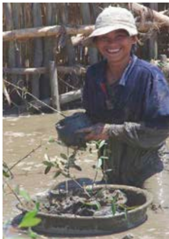
Left: Planting for coastal resilience.

Based on the success of the Kien Giang pilot project, Australia invested A$9.6 million of its fast-start finance to support an expanded partnership between Australia and Germany across five provinces in the Mekong Delta, under the Climate Change and Coastal Ecosystems Program. The five year program will be supported by a national component that will promote the sharing of lessons and experiences across provinces to inform a national response to climate change.