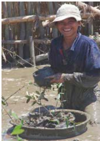
Left: Planting for coastal resilience.

Based on the success of the Kien Giang pilot project, Australia invested A$9.6 million of its fast-start finance to support an expanded partnership between Australia and Germany across five provinces in the Mekong Delta, under the Climate Change and Coastal Ecosystems Program. The five year program will be supported by a national component that will promote the sharing of lessons and experiences across provinces to inform a national response to climate change.