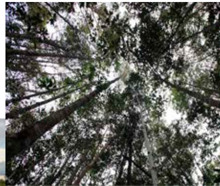
Above: Forest in Kalimantan, Indonesia.