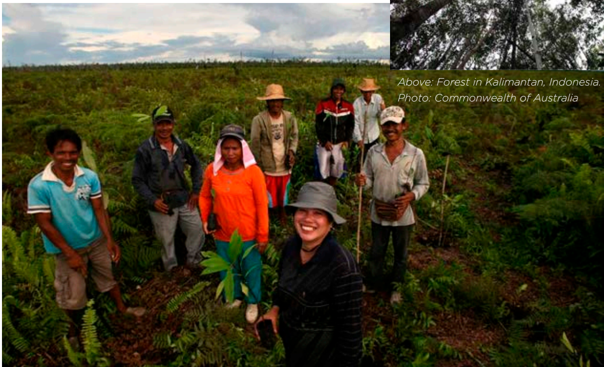
Above: Australia is supporting reforestation work.