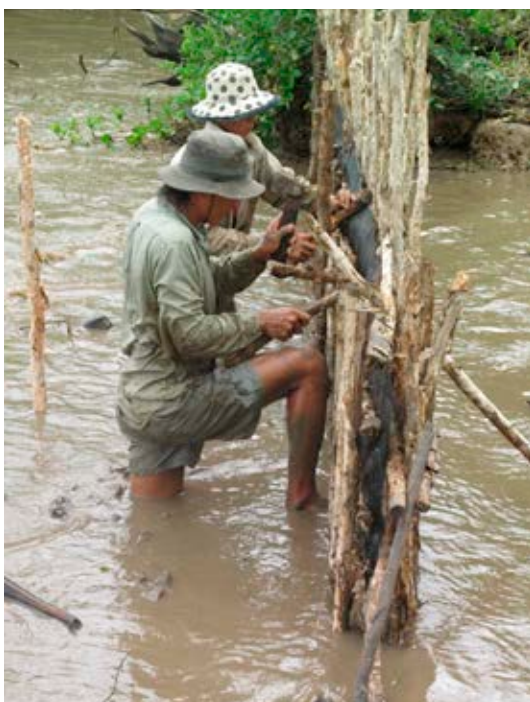
Left: In Vietnam, silt trap fences like this assist to reduce risks to communities from storm surges and flooding by reducing wave energy from storm surges by 60 per cent and prevent silt from stifling mangrove growth.