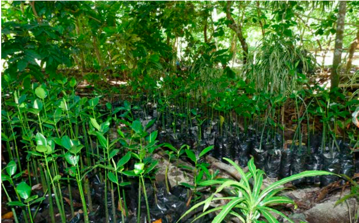
Above: The development of drought resistant crop gardens and mangrove propagation to assist communities in Papua New Guinea to adapt to climate change.