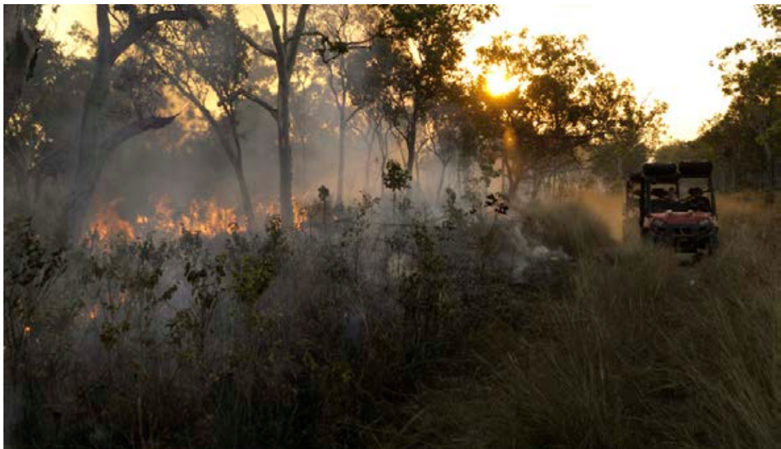
Above: Fire management, Fish River, Australia.

Through a new methodology developed under Australia's Carbon Farming Initiative (CFI), Indigenous communities and pastoralists in tropical north Australia are reducing emissions by reintroducing traditional-style early dry season savanna burning practices. The CFI is allowing these groups to receive payments for the reduction, supplementing other income streams.