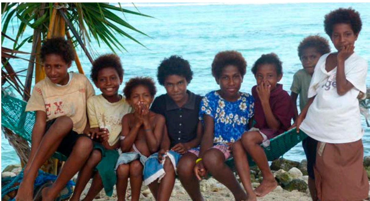
Above: Australia is working in Papua New Guinea to assist communities to build resilience to climate change into the future.