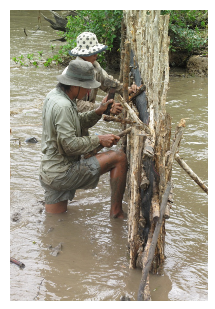
The impact of climate change is already being felt in Kien Giang, Vietnam. Silt trap fences like this assist to reduce risks to communities from storm surges and flooding by reducing wave energy from storm surges by 60 per cent and prevent silt from stifling mangrove growth.

Under the program, communities develop their own course of action to deal with a changing climate and to protect their coastal ecosystems. The program is being implemented under a dedicated arrangement between Australia and Germany and will finish in 2016.