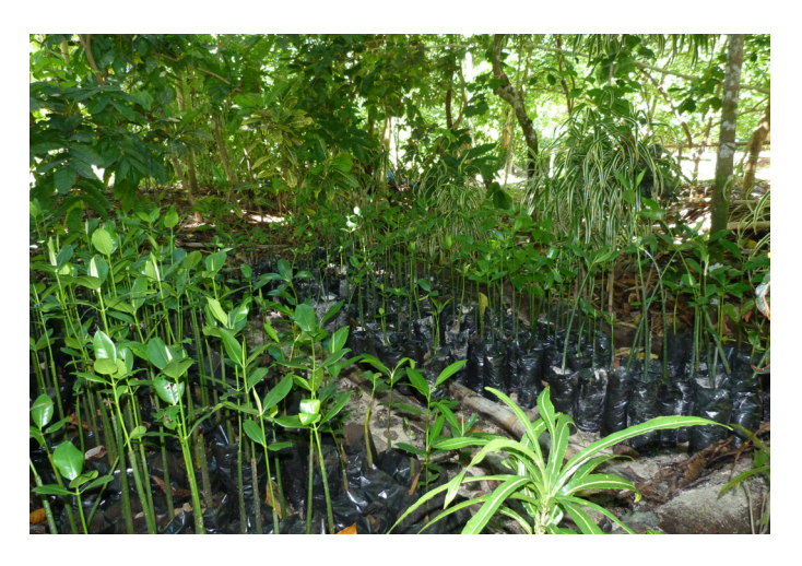
The development of drought resistant crop gardens and mangrove propagation to assist communities in Papua New Guinea to adapt to climate change.