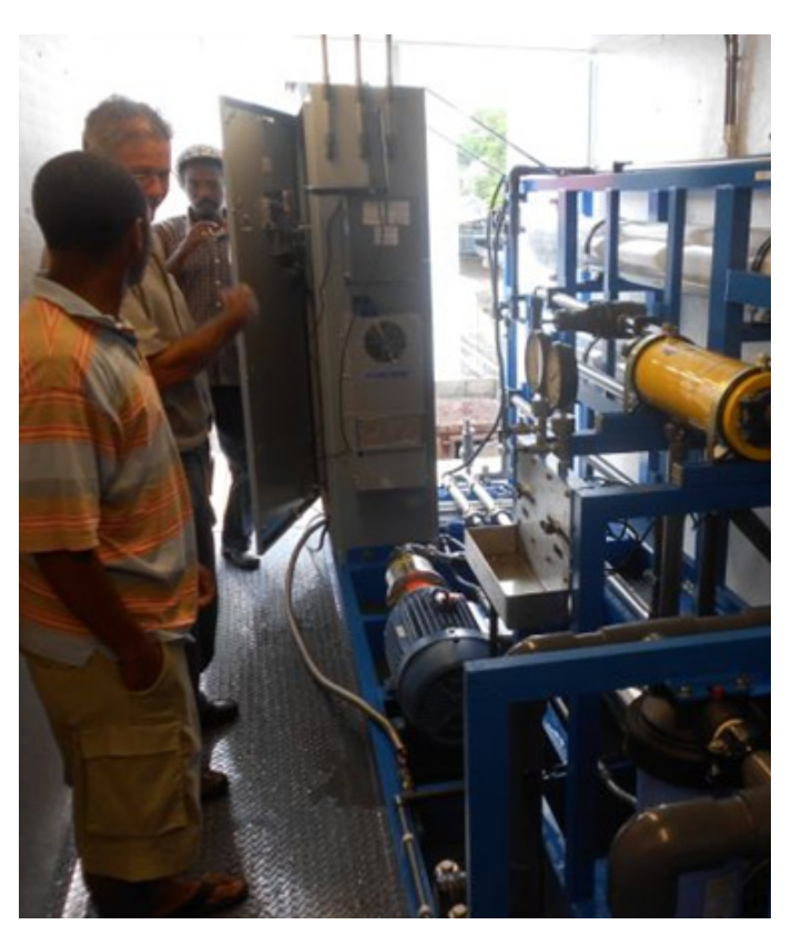
Australia's fast-start finance is helping to support clean technology address water security issues, like this solar powered salt-water reverse osmosis system in Bequia.

The pilot has involved installing a salt-water reverse osmosis system, which utilises renewable photo-voltaic (solar) energy. With the systems now in action, this project has delivered potable water that exceeds previous water standards, both in cost and water quality. The renewable solar energy that powers the system feeds excess power it produces into the national utility, ensuring the system's sustainability.