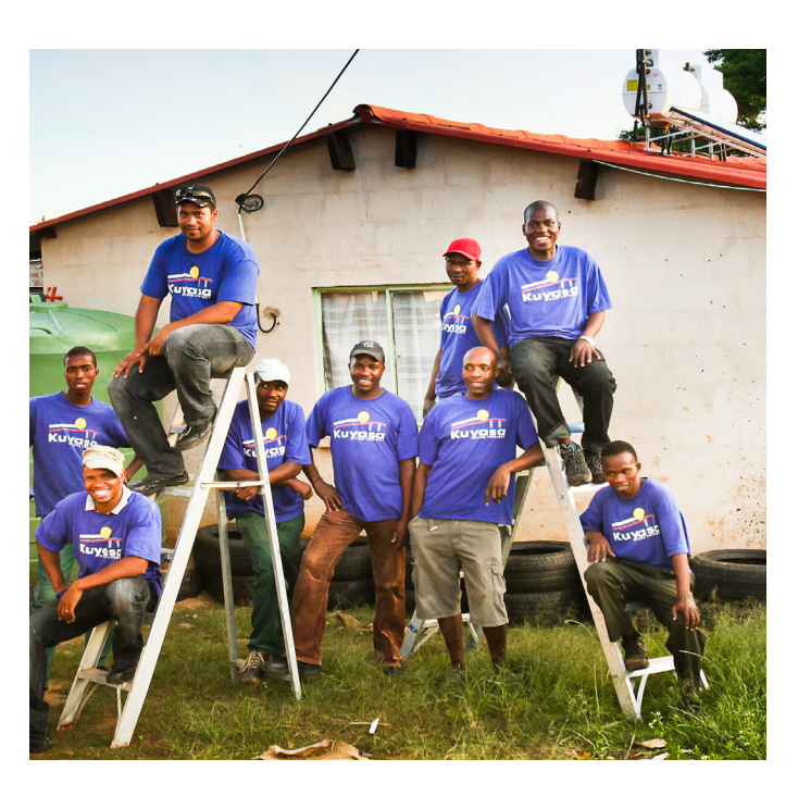
Australia's fast-start finance is being used to employ locally engaged staff to carry out this energy efficiency and sustainability development initiative.

The Cato Manor Project will build knowledge and understanding of low-emission interventions in low-cost housing programs which will be valuable to governments and organisations seeking to establish similar projects in developing countries.