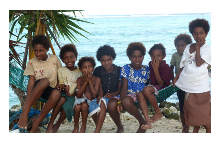
Australia is working in Papua New Guinea to assist communities to build resilience to climate change into the future.

These programs empower communities to build their own capacity and skills to identify, trouble-shoot and act on the range of challenges that climate change presents.