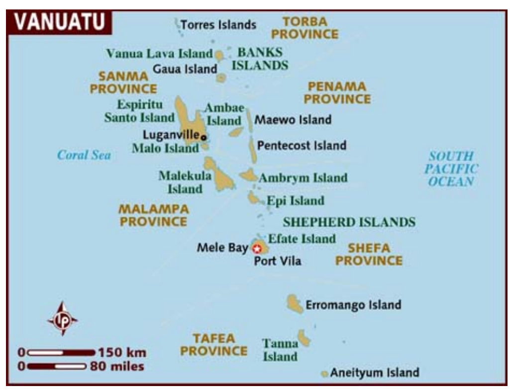
Figure 1: Map of Vanuatu<sup>17</sup>