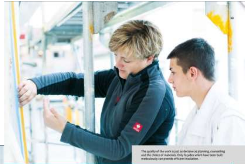
The quality of the work is just as decisive as planning, counseling and the choice of materials. Only facades which have been built meticulously can provide efficient insulation.