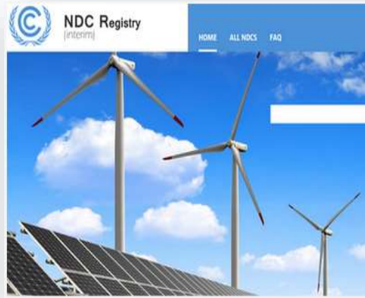
Parties will review their NDCs