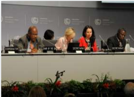
Education Day at COP23