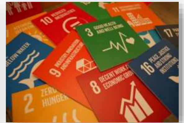
Sustainable Development Agenda