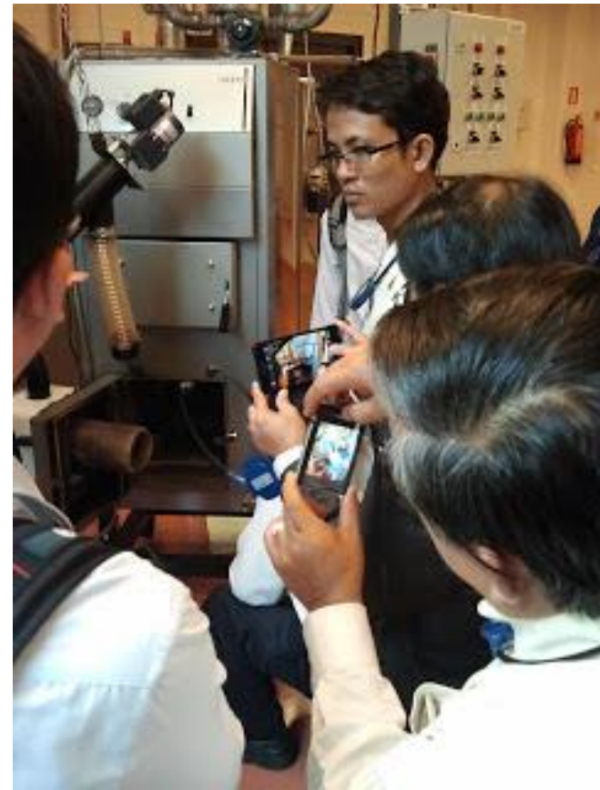
Images from the MODESPO (Models in Energy System Design and Policy Planning) -program