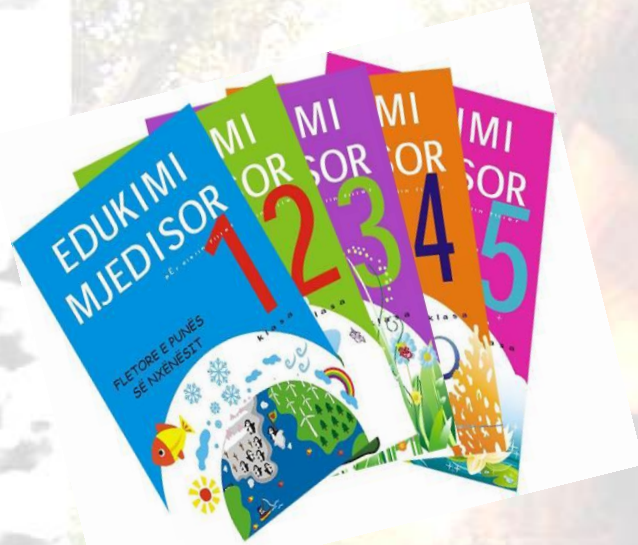
The student's working materials