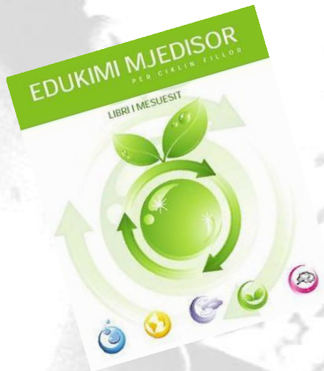
The teacher's guide