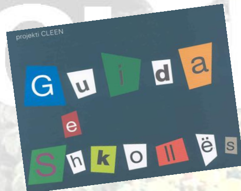
The school guide