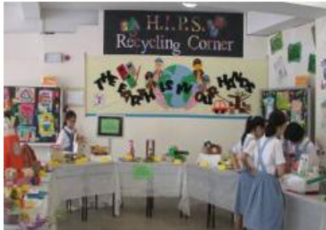
Engaging schools on recycling (Recycling Corner)