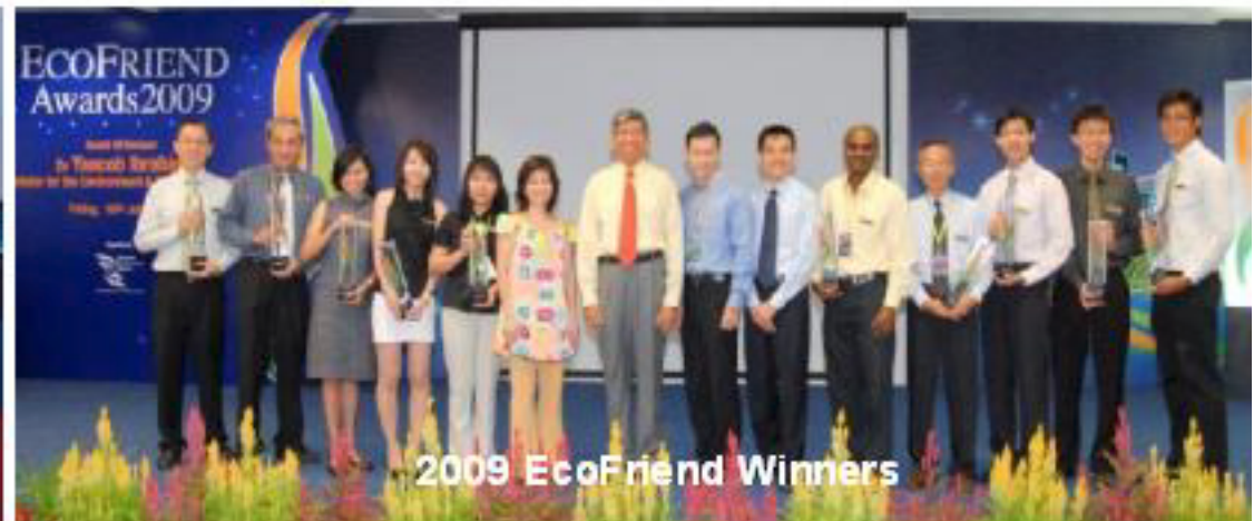
2009 EcoFriend Winners