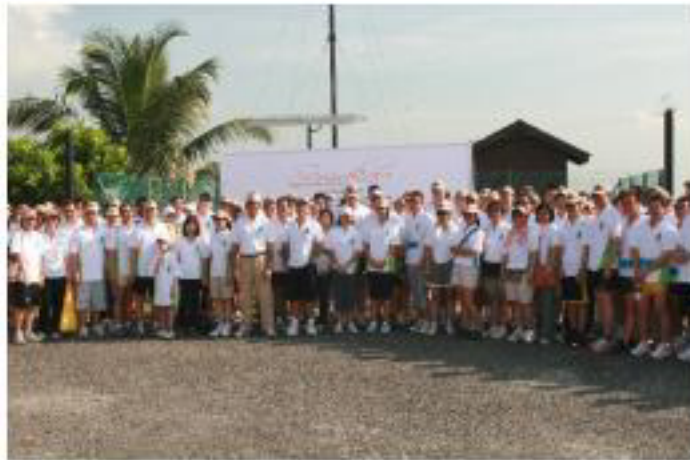
Semakau CEO Run