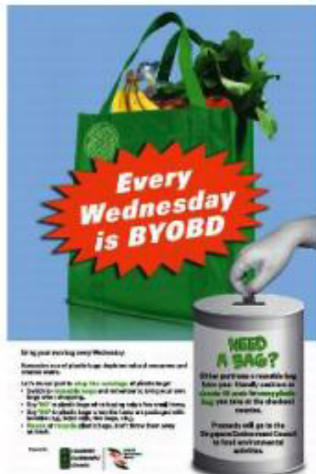
Engaging the community on using less plastic bags