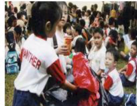
Engaging the community on litter-free efforts