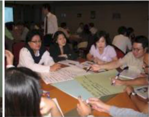
Corporate Environment Champions