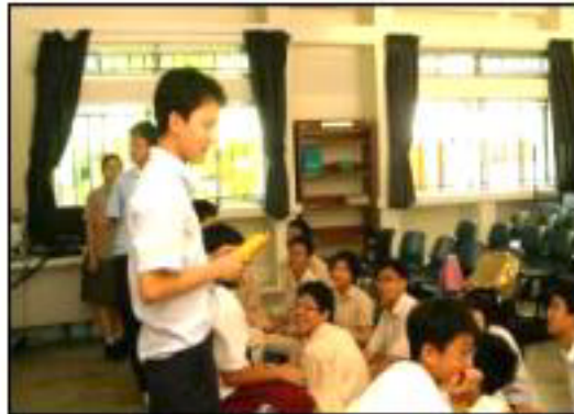
Regional Environmental Science Conference (Nanyang Girls' High)