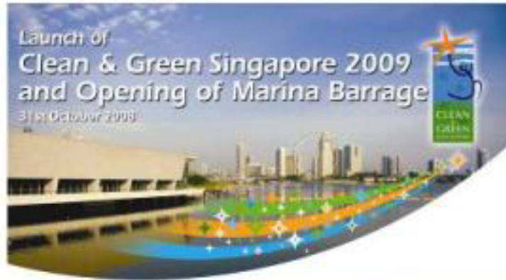
CGS Launch Ceremony