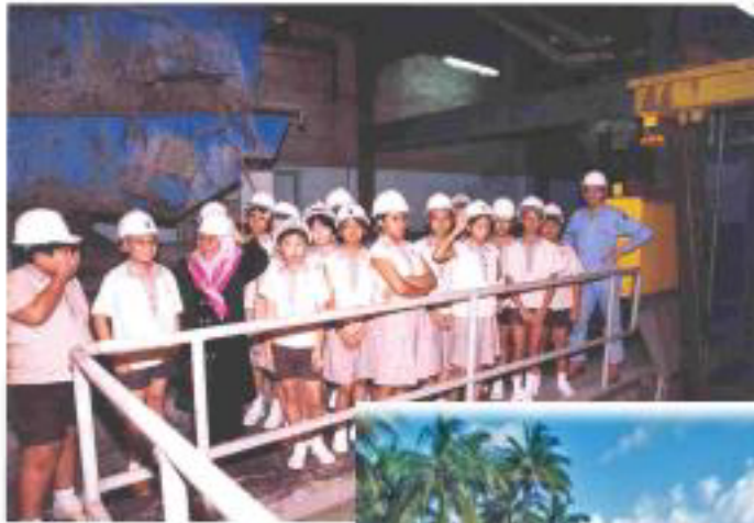
Learning visits / Field trips