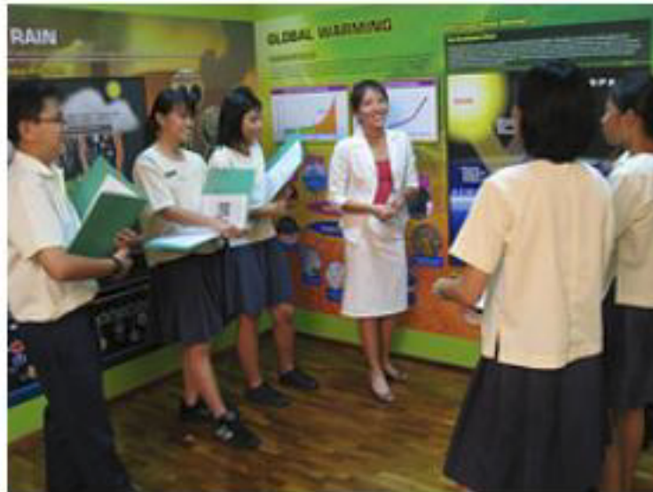
Environmental Education Hub (Marsiling Secondary School)