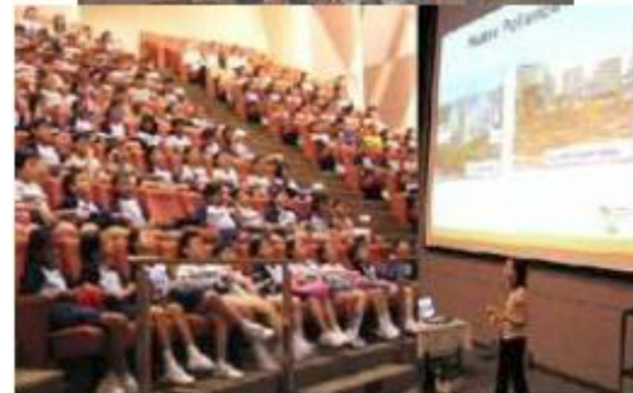
Talks and exhibitions