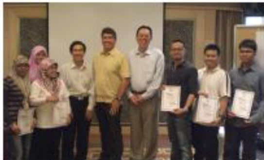
Student Environment Champions / Youth Environment Envoys