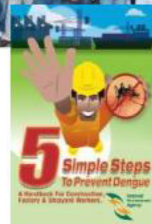
Engaging the community on dengue prevention