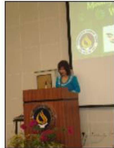
Environmental Education Seminar (Just One Earth) (Commonwealth Sec)