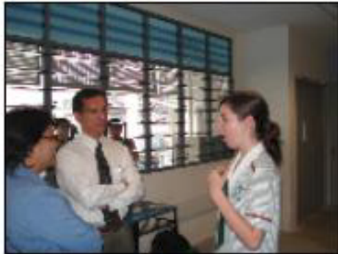
International Youth Environment Seminar (Nan Hua High)