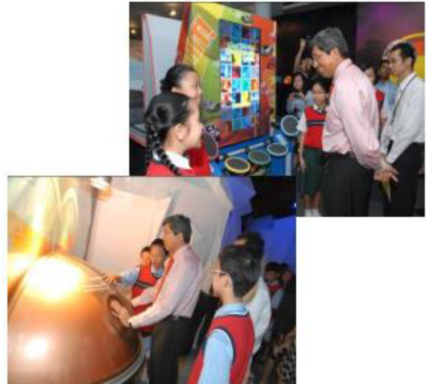
Climate Change Exhibition at Science Centre Singapore