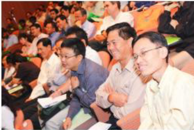
Conference for Environment Champion