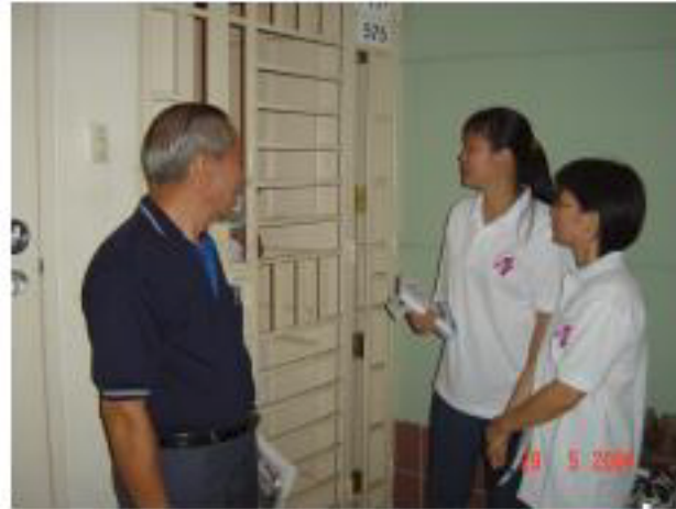
Environment Champions (Community)