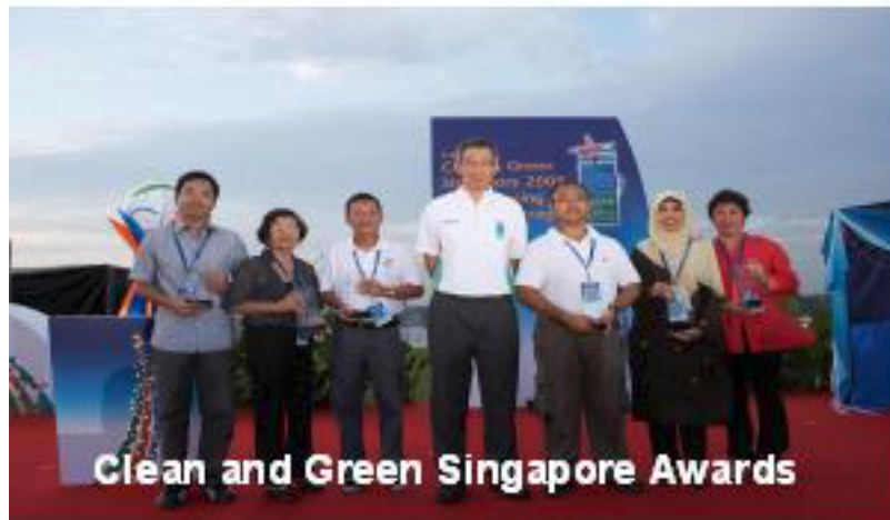
Clean and Green Singapore Awards