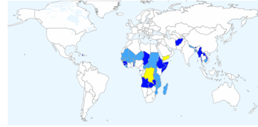
Countries Requesting Support

Asia: Bangladesh Cambodia, Nepal, Yemen.