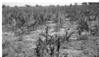
Multimedia: Hibiscus Cultivation Sudan