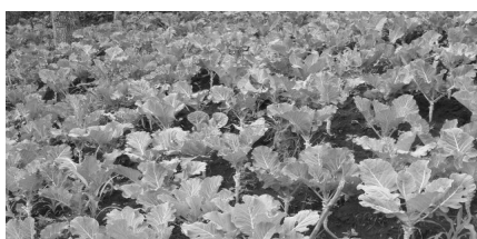
Video: Vegetable Drying and Preservation Zimbabwe