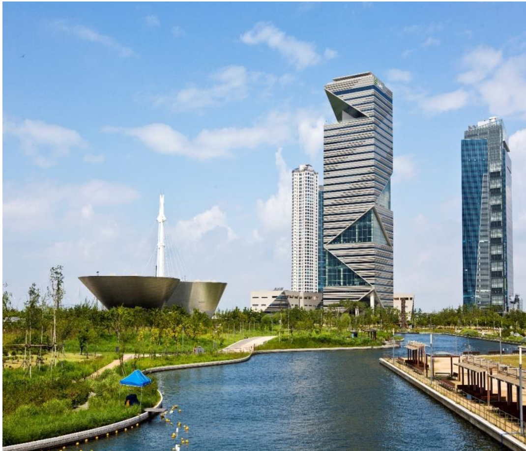
IBS Tower & G-Tower