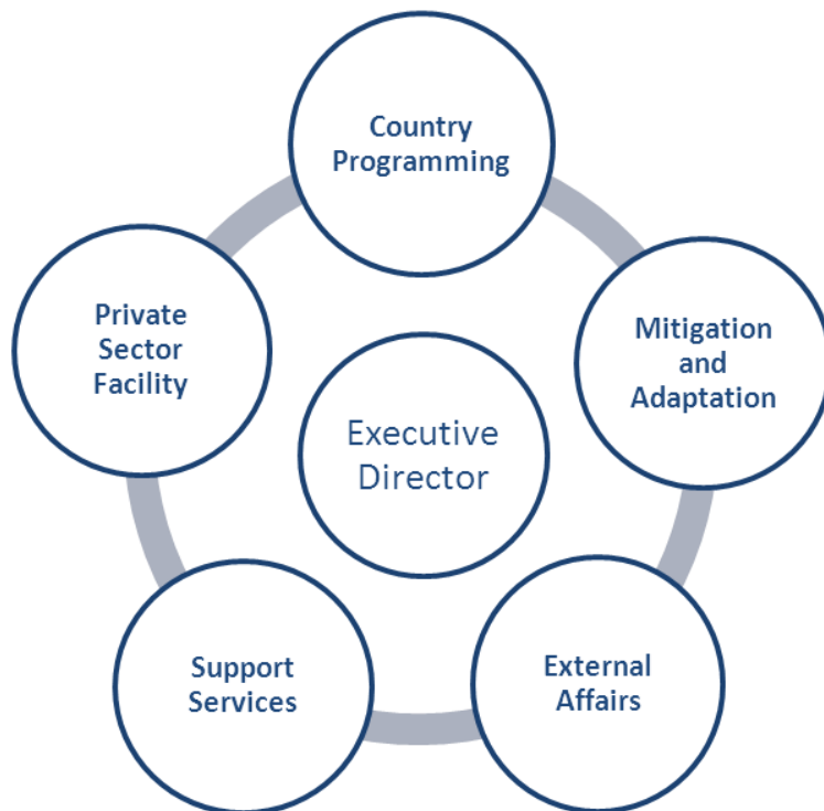
Figure 1. Initial structure of the Secretariat