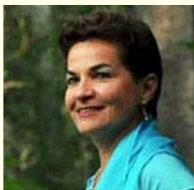
Yvo de Boer, Executive Secretary United Nations Framework Convention on Climate Change

The second sessions of UN climate change negotiations in 2010 get underway at the end of May in Bonn. Revised negotiating texts will again be on the table, several of which came close to completion in Copenhagen last year.