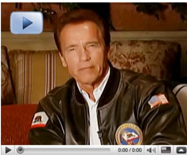
VIDEO MESSAGE FOR COP 15 BY ARNOLD SCHWARZENEGGER, GOVERNOR OF CALIFORNIA