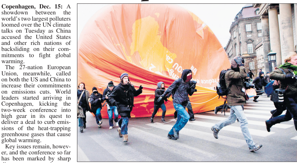
Environmental activists from Climate No Borders run with a stolen balloon during a demonstration in Copenhagen on Tuesday.

China, the world's largest polluter, is grouped with developing nations at the talks but the US doesn't consider China a nation in need of climate change aid. In Beijing, China accused developed countries on Tuesday of trying to escape