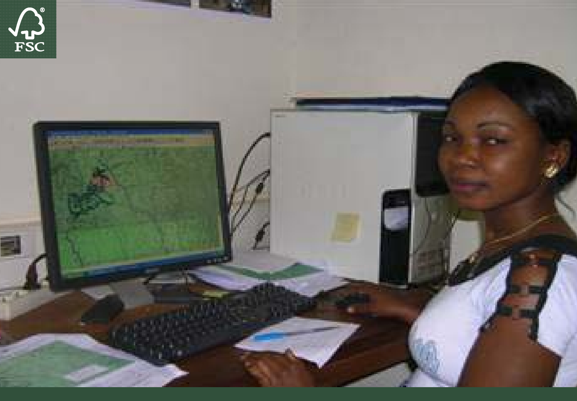
Back from the expedition, data are transferred and analyzed on the computer