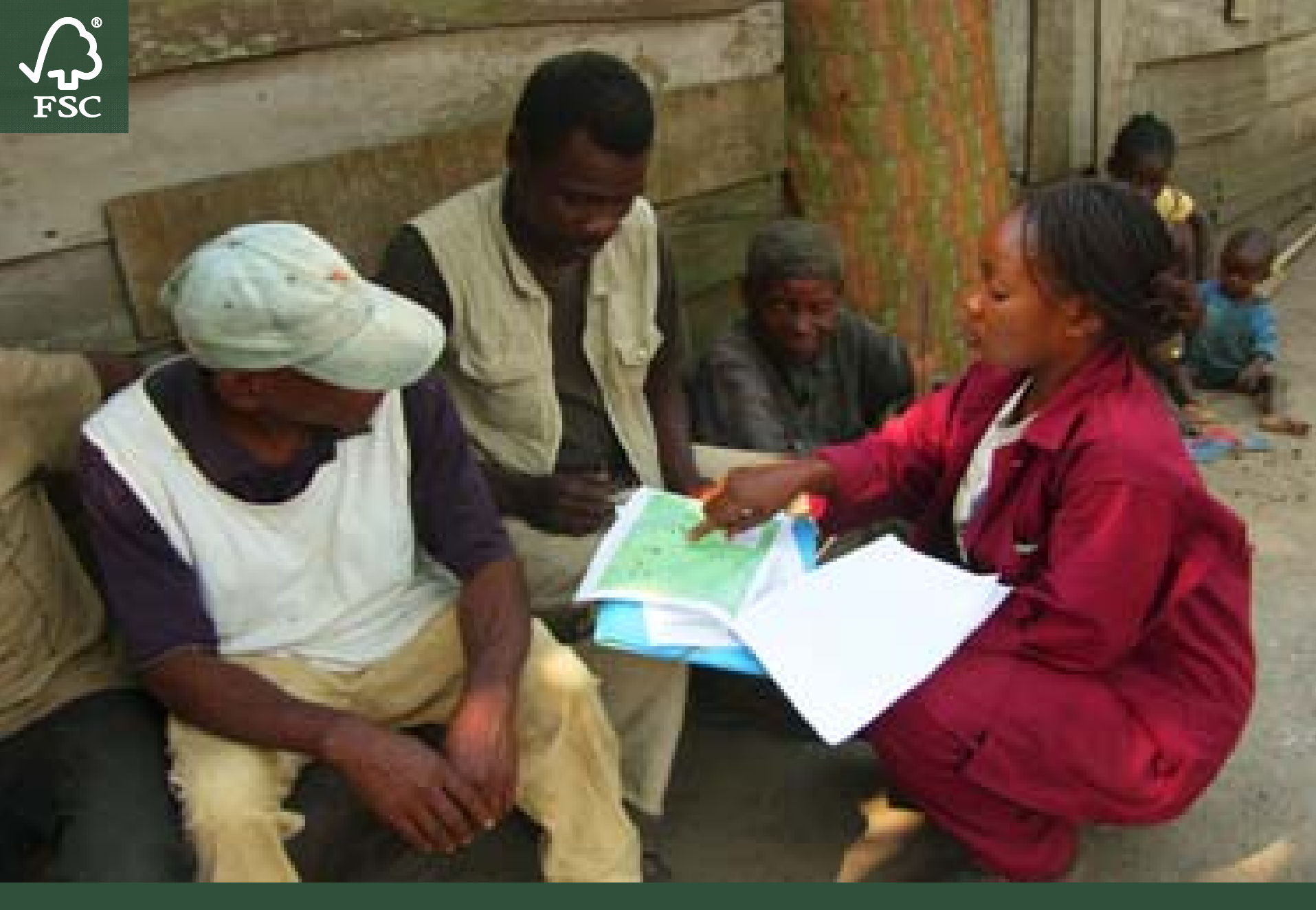
Maps are given back to the communities