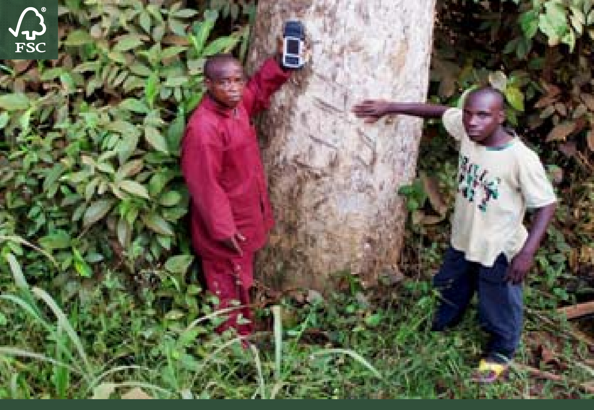
Key resources and sensitive areas are identified with precision