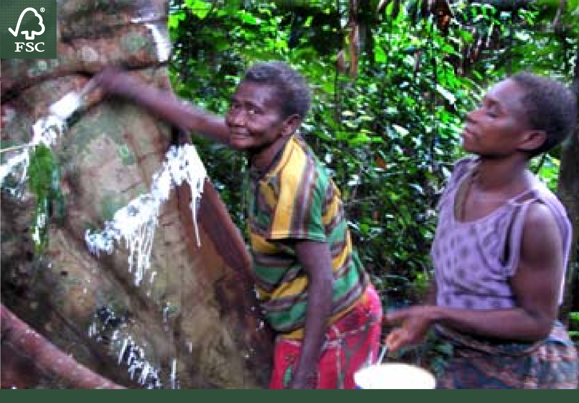
Another expedition... communities mark the key resources with paint