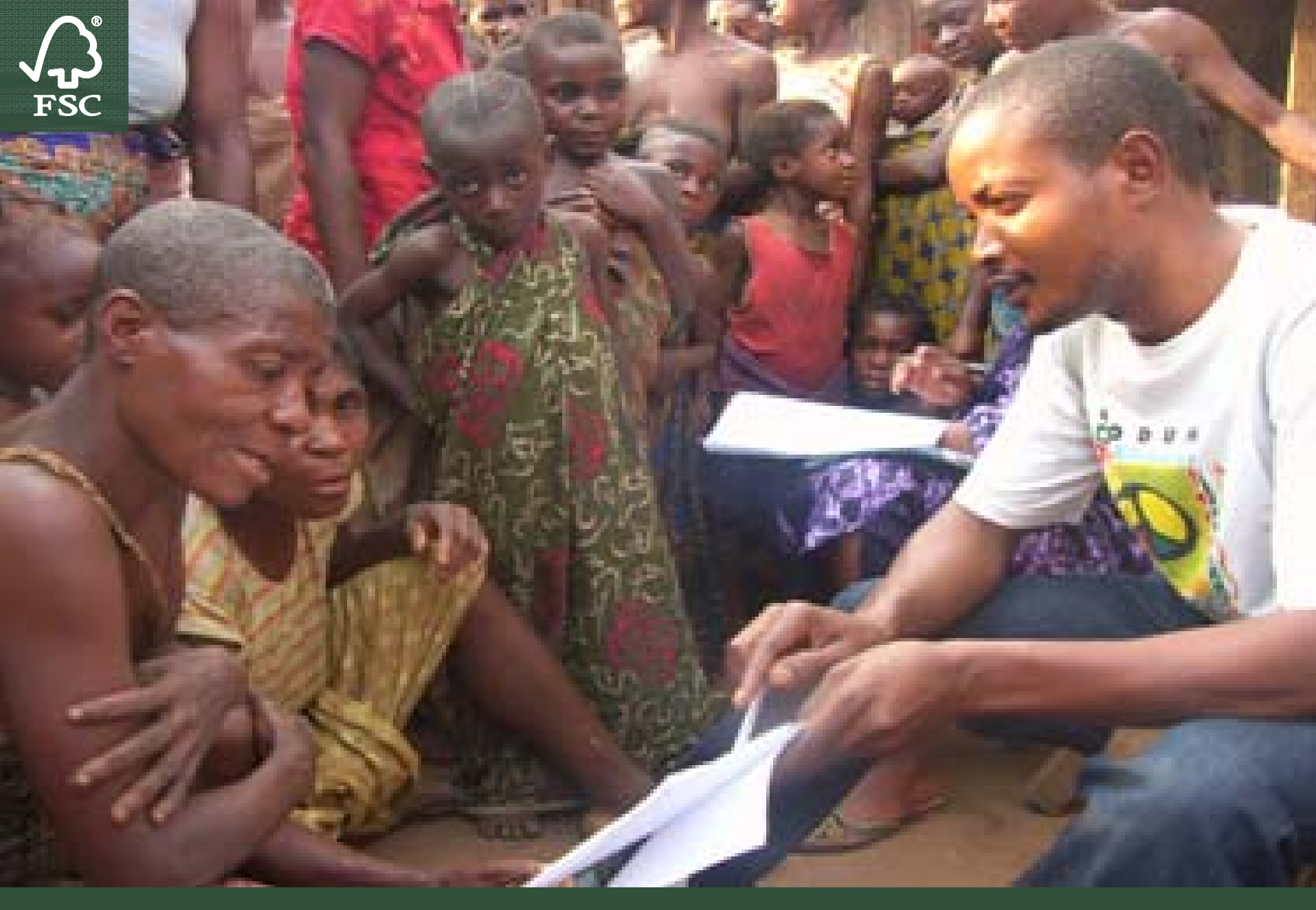
Semi-nomadic communities of each zone are directly contacted