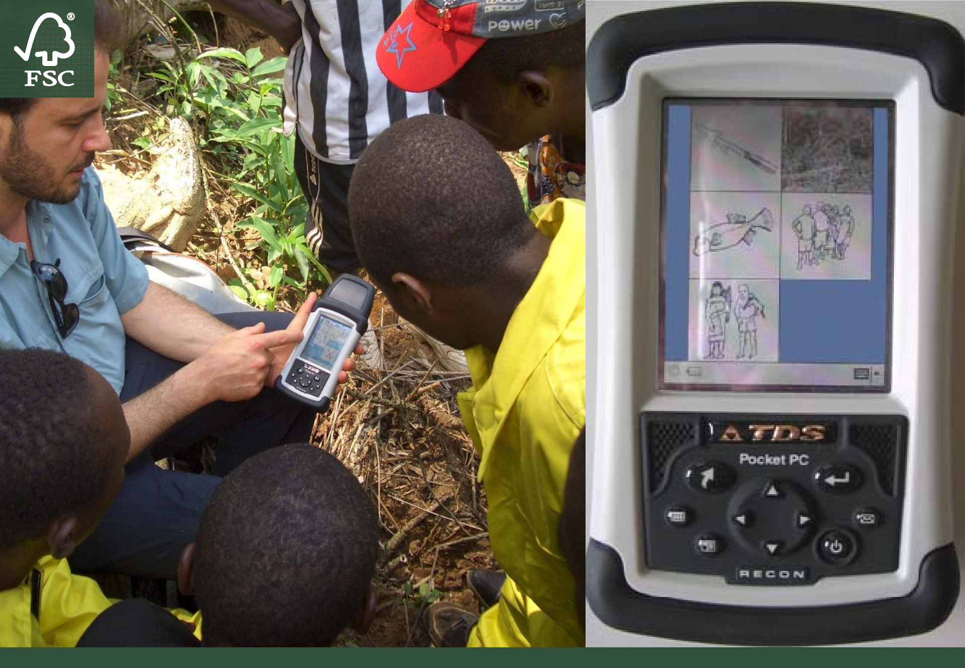
GPS handheld computer specially made for non-literate people and for forest use