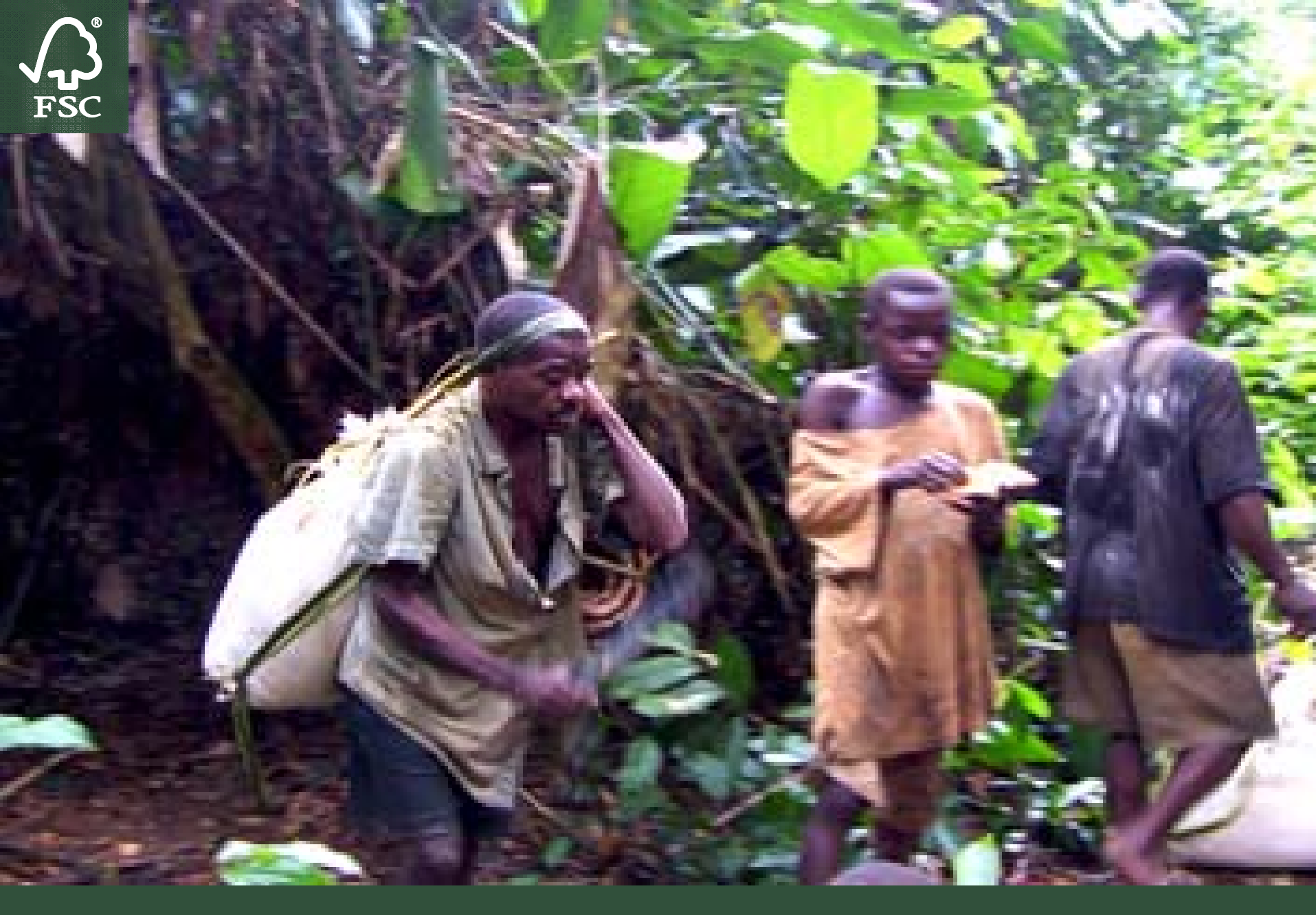
The forest expedition starts... semi-nomadic communities and CIB communicators