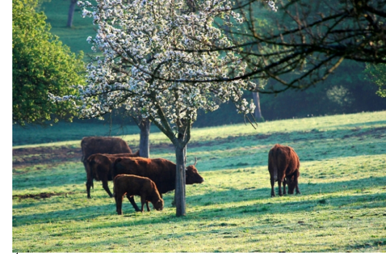
« Pré-vergers » : orchards + pasture

Many other overseas : shifting agriculture, understorey vanilla