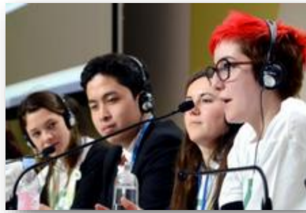
Young and Future Generations Day 9 November COP 23