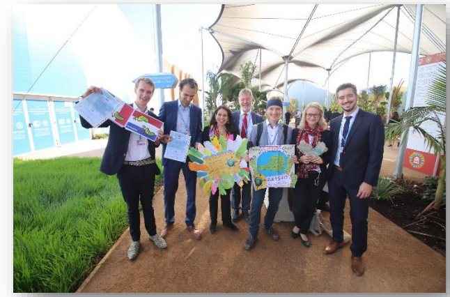
Education Day 13 or 15 November COP 23