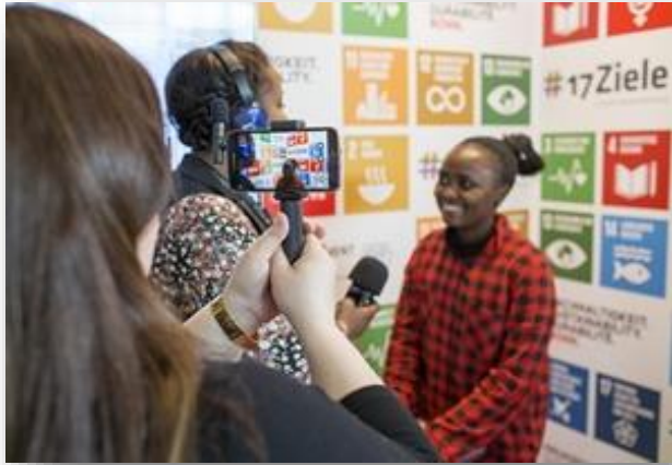
Global Youth Video Competition 10 May – 18 August