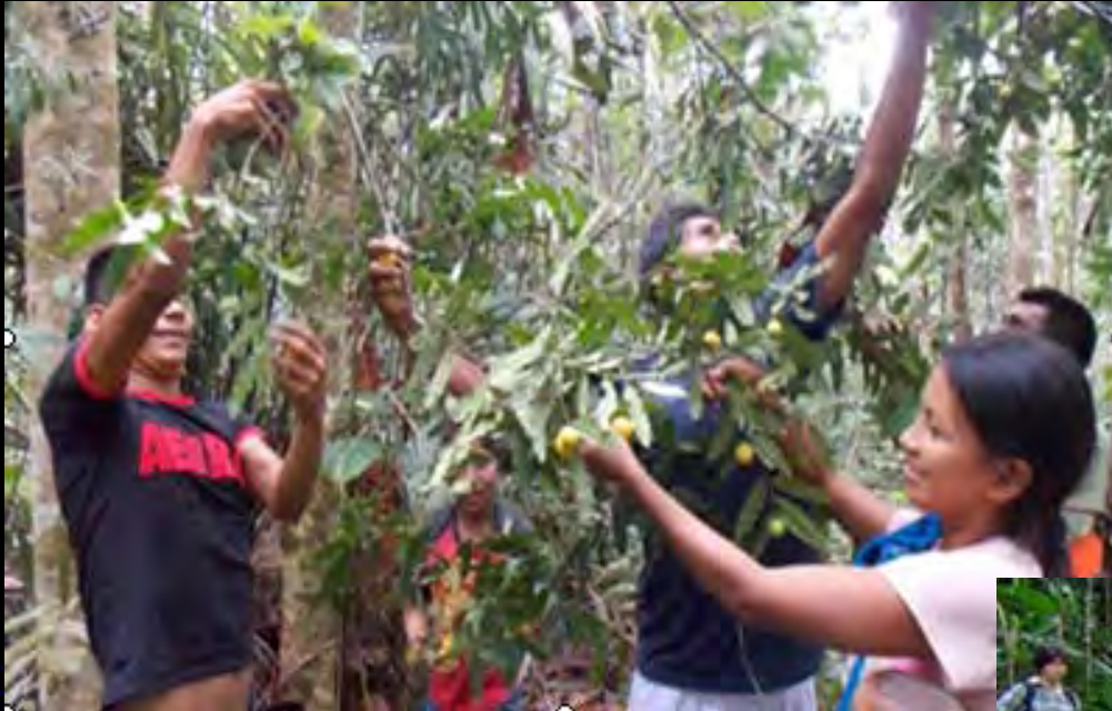
Women and men gather seeds and seedlings in the forest