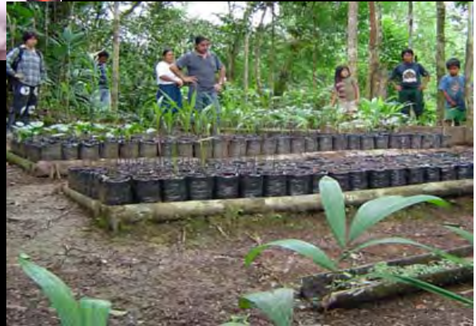
Seedling nursery of species the Amazon forest