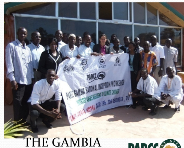
PARCC Protected Areas Resilient to Climate Change in West Africa