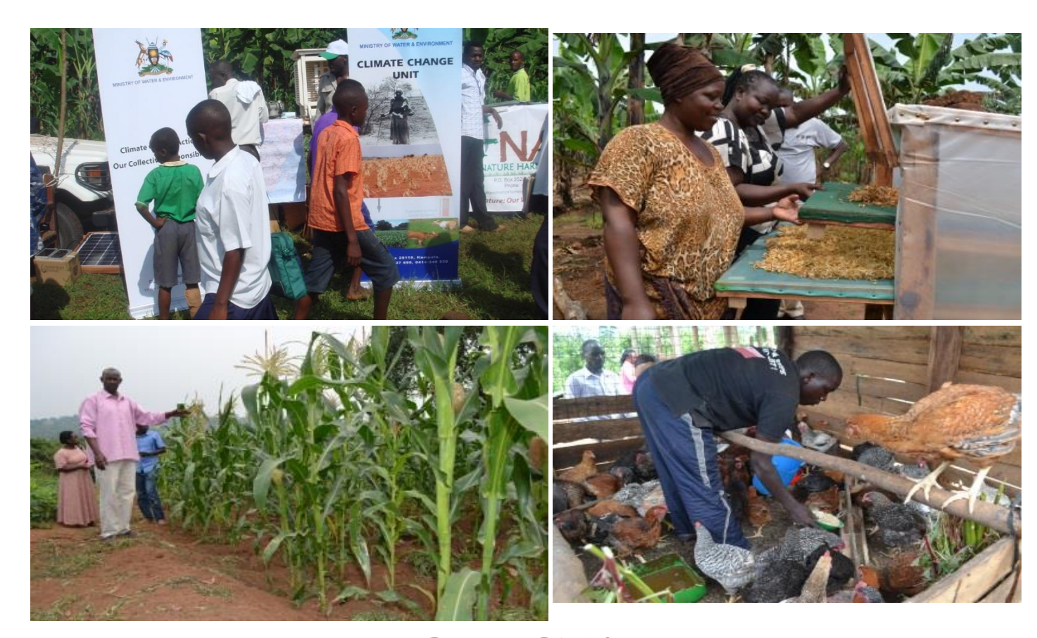
End Of Slides