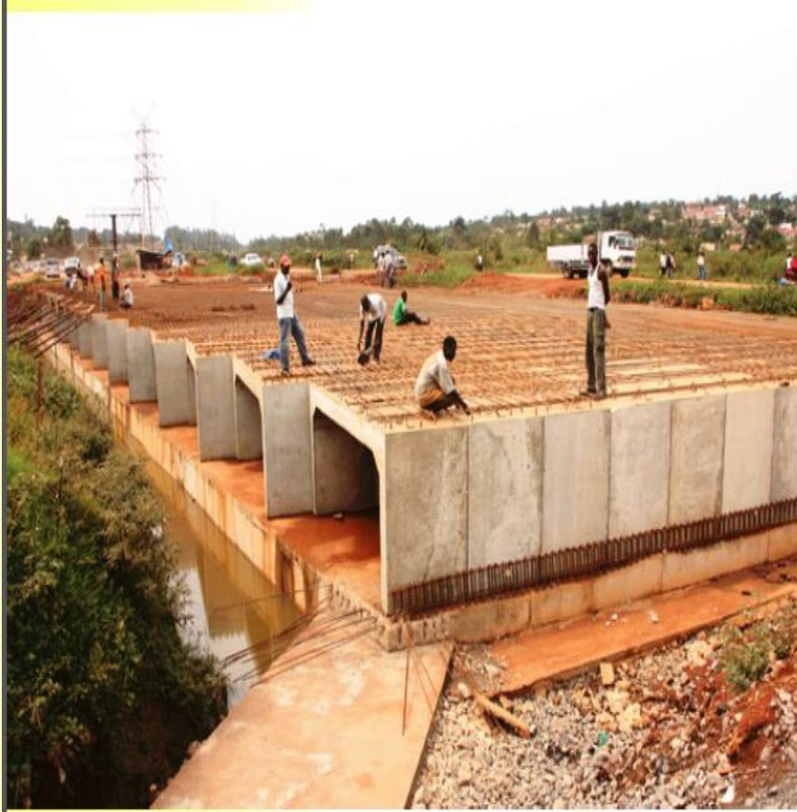
Construction of Lubigi Channel