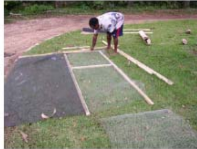
2. Stretching the chicken wire on the frame