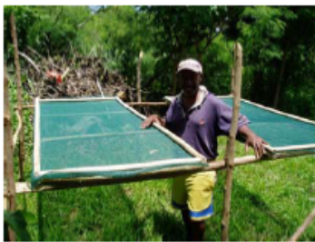
3. Organising a support for the frame