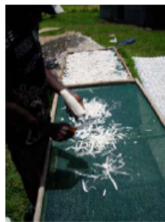
4. Cutting some chips