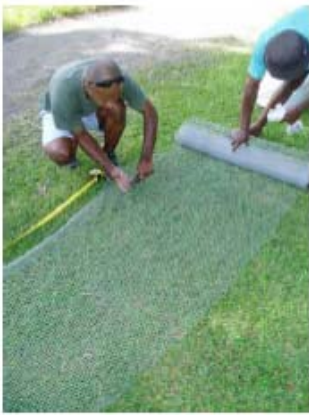
1. Cutting the chicken wire

Recommended structure is a (200 x 91) cm frame on which is stretched some chicken wire covered by some mosquito net. These frames allow for the drying of up to 12 kg of fresh cassava over two to three sunny days.