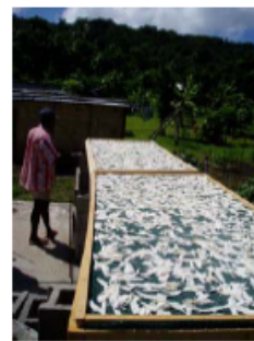
5. Driers being used