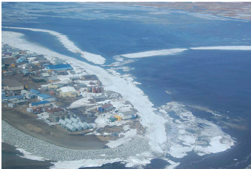
Fig. S2. Kivalina.