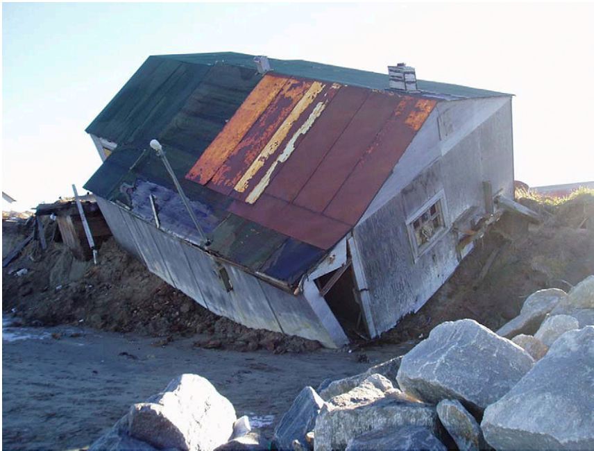
Fig. S3. Shishmaref.