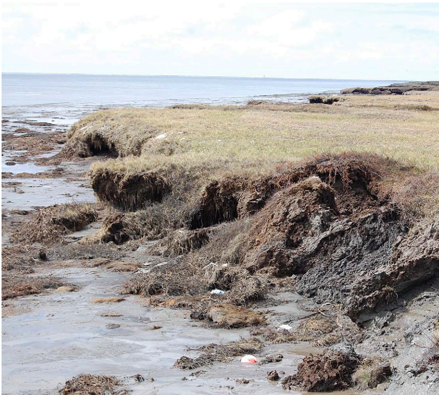
Fig. S4. Coastal erosion in Newtok.