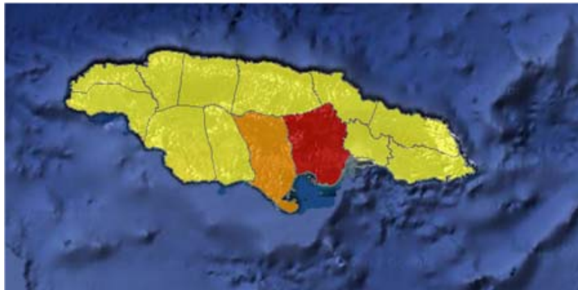
Number of disaster datacards