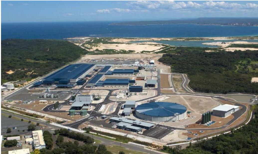
Sydney Desalination Plant