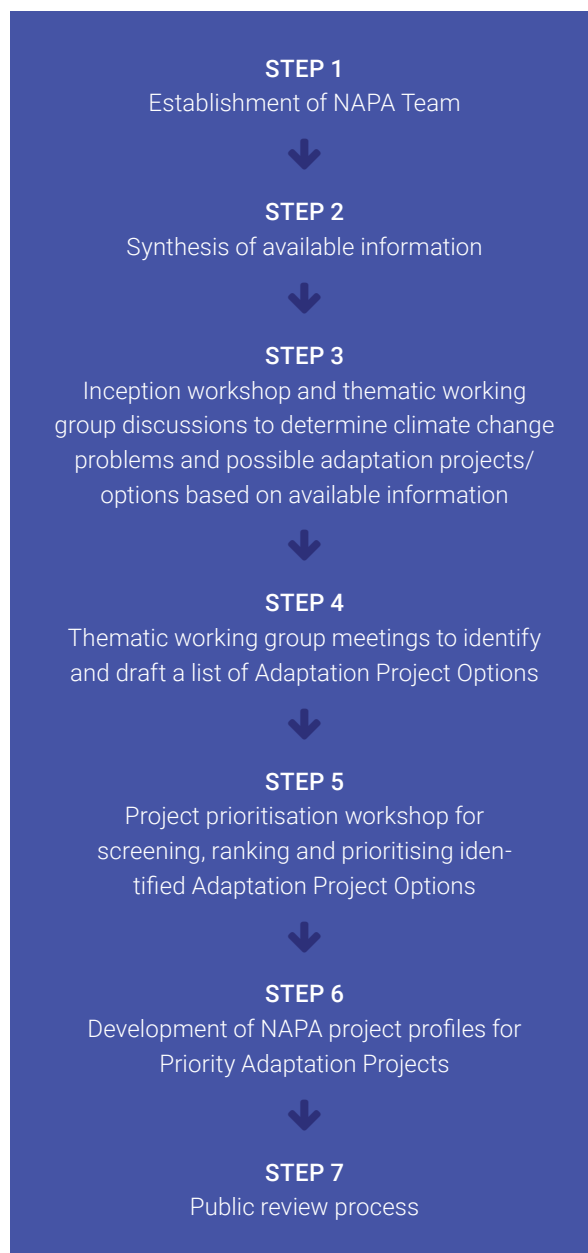
Figure 2: An outline of the steps used in the South Sudan NAPA preparation process.

The preparation of the NAPA was guided by a participatory process, involving multiple stakeholders from the public sector, private sector, NGOs and academia. Furthermore, the NAPA adopted a multidisciplinary and complementary approach building on existing plans, programs and national sectoral policies. The main objective of the consultative process was to publicise the project activities, and solicit inputs and feedback from all stakeholders on the identification and prioritisation of Adaptation Project Options. Because of the tense political situation and potential security risks in South Sudan at the time that the NAPA was prepared, stakeholder consultations with