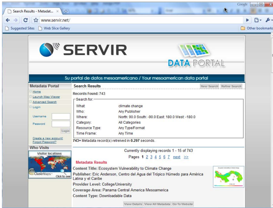
Figure 1: Climate change datasets are available through SERVIR

Observations (GEO), SERVIR was recognized as a first of its kind model in the implementation of the Global Earth Observation System of Systems (GEOSS) concept.